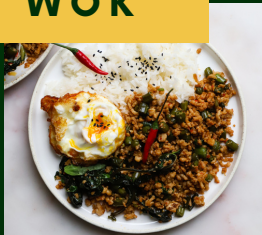
Basil & Fried Egg