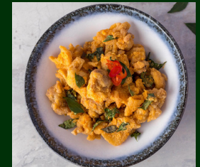
Salted Egg Yolk