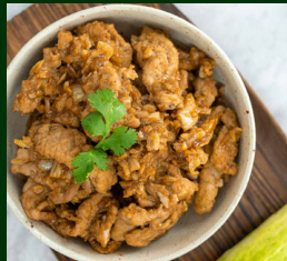
Garlic & Pepper